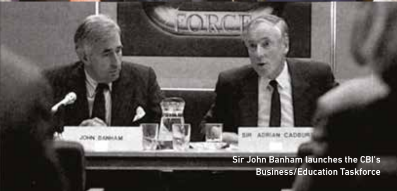
Sir John Banham launches the CBI's Business/Education Taskforce