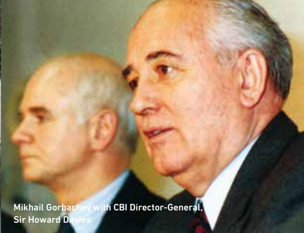
Mikhail Gorbachev with CBI Director-General, Sir Howard Davies