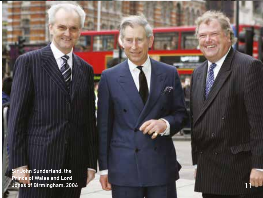
Sir John Sunderland, the Prince of Wales and Lord Jones of Birmingham, 2006