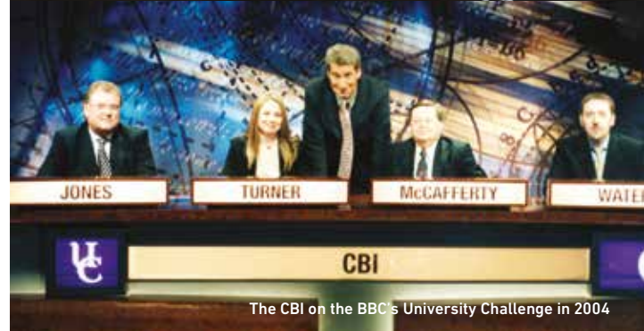
The CBI on the BBC's University Challenge in 2004