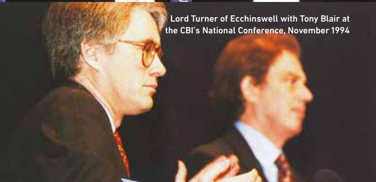
Lord Turner of Ecchinswell with Tony Blair at the CBI's National Conference, November 1994