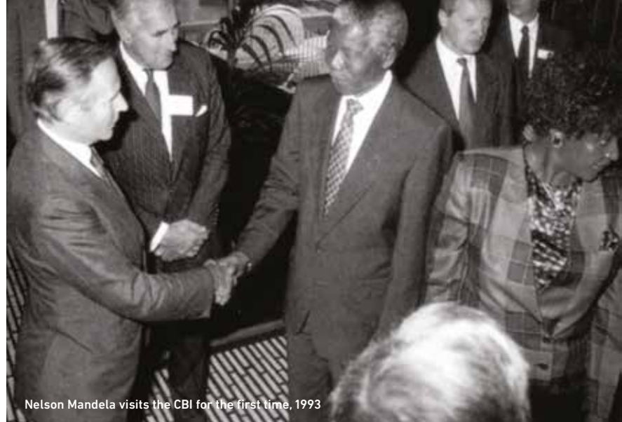
Nelson Mandela visits the CBI for the first time, 1993