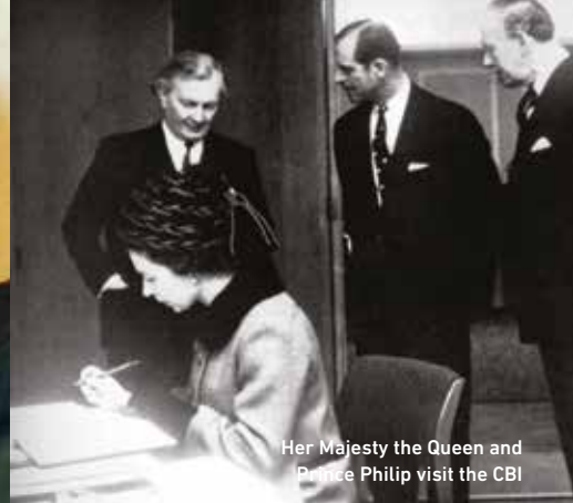
Her Majesty the Queen and Prince Philip visit the CBI