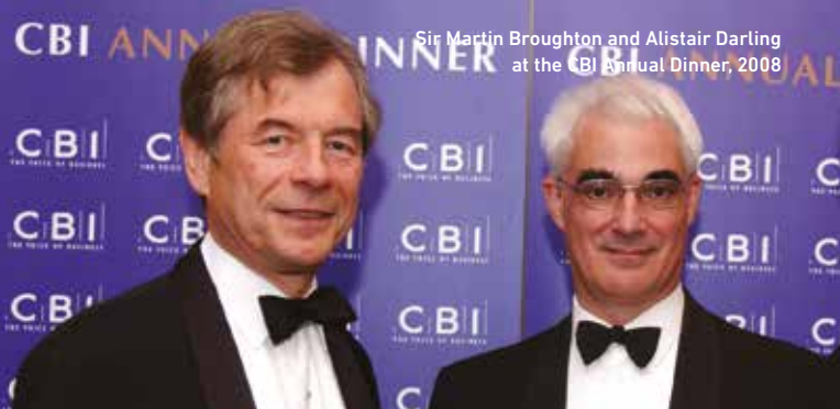
Sir Martin Broughton and Alistair Darling at the CBI Annual Dinner, 2008